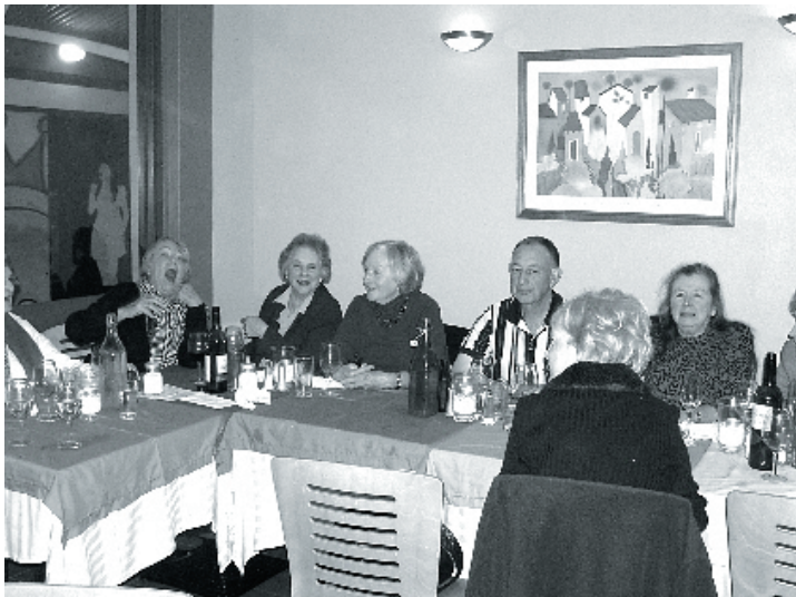
the group dining at Mi Casa on 29 th May 2008