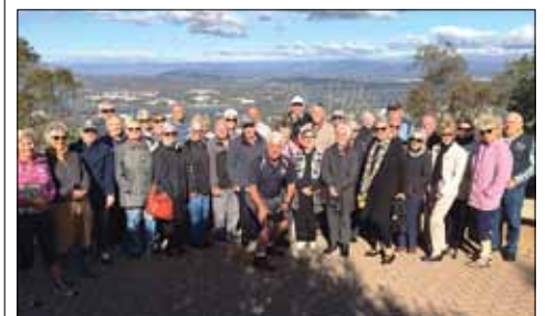
U3A members on Coach Tour to Canberra over ANZAC Day (Lake Burleigh Griffin in the background).